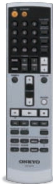
RI (Remote Interactive) remote