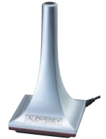
Microphone for Audyssey