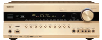
Color availability depends on region.