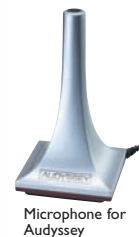
Microphone for Audyssey

The lesser-used controls are neatly tucked away behind the drop-down panel.