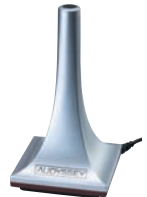
Microphone for Audyssey

The less-used controls are neatly tucked away behind the drop-down panel.